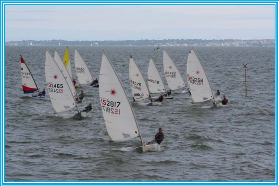
Dinghy Weeks 2010