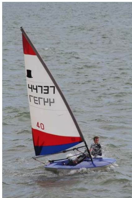
Dingy week two 2010 In force 5 winds