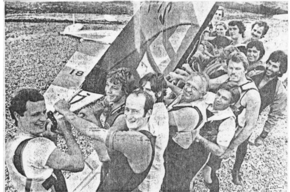
Hill head sailors who crossed the Solent on Saturday to raise money for the Parkinsons Disease Society.

I should have mentioned more than half of the participants were not wearing a harness. It would be nice to see the younger members say 'hey, let's do something like this for such and such charity'. So much easier today to organize this type of event