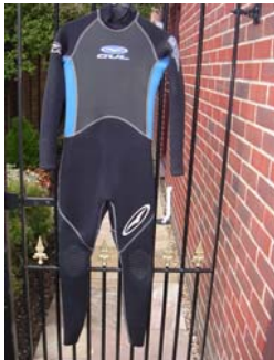
GUL Quest wetsuit, junior, size Fits approx 5ft to 5ft 6in, good condition. £10