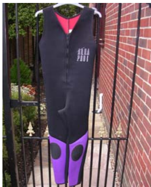
Aqua Pro wetsuit, size junior, good condition. £10