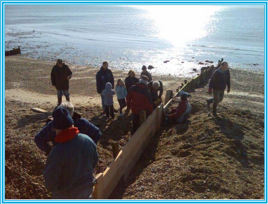
Haven Working Party doing a sterling job!