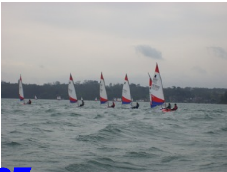
27 Arriving at Wootton Creek

The next session was at Hill Head Sailing Club . For me this was quite exciting to be sailing at my home club with the rest of the topper squad. We were all beginning to gel together and get to know each other. Although I already knew everyone from Hill Head we were all becoming really great friends and were constantly teasing each other, laughing at each other and ourselves, helping each other out, but most of all just enjoying our love of sailing together.