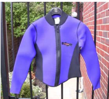
Typhoon Wetsuit Sailing Jacket, Junior size fits 5ft—5ft.8 approx good condition. £10

Contact: Graham Pike - gjpike@btinternet.com 01489582998