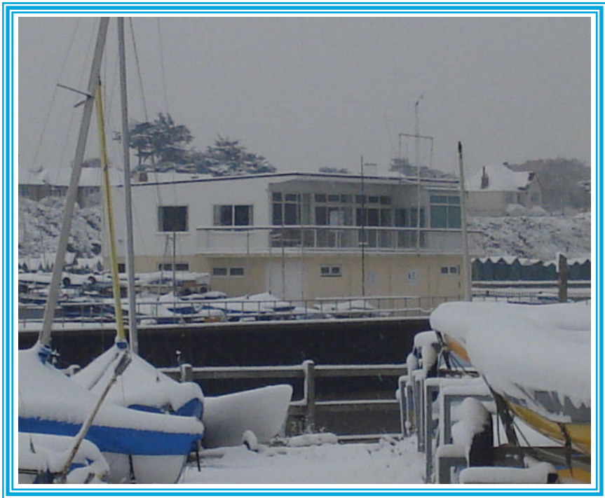
The Club Snow Scene!